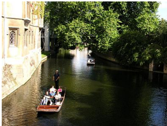
Kings College, Cambridge